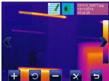
Vocal and textual annotations