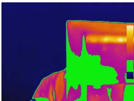
Advanced analysis: Isotherm feature